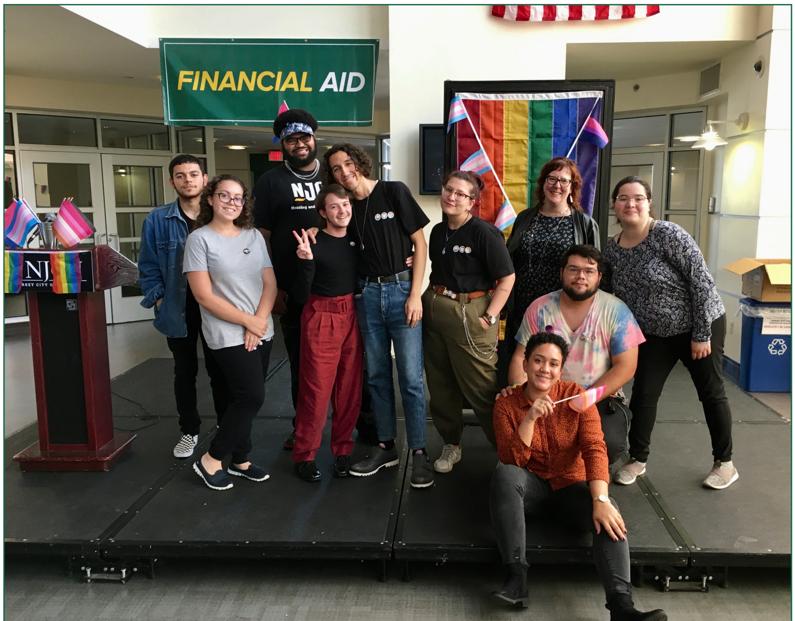
The LGBTQ Alliance helped celebrate Coming Out Day on campus.

3 percent ($180.75) increase from 2018-2019 school year