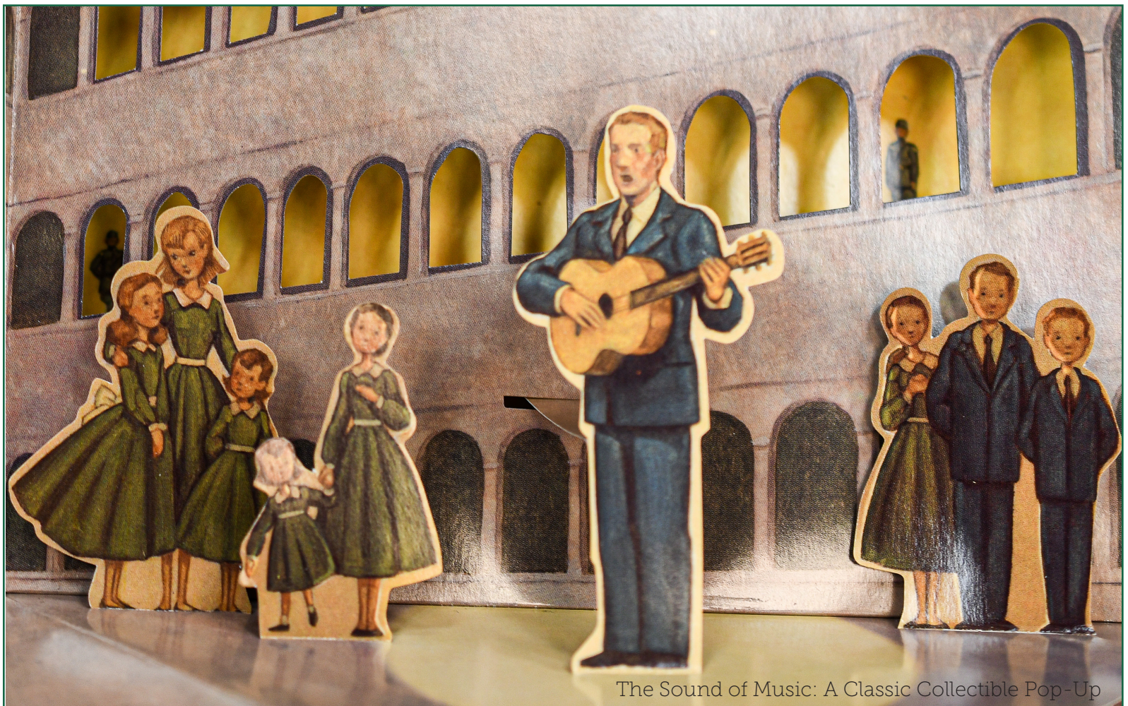
The Sound of Music: A Classic Collectible Pop-Up